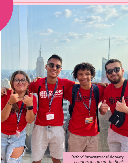
Oxford International Activity Leaders at Top of the Rock

Discover the iconic landmarks of New York City with excursions to Times Square, the Statue of Liberty, and the expansive oasis of Central Park . This is your chance to immerse yourself in the heartbeat of urban culture while making unforgettable memories.