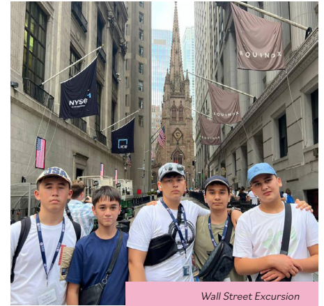
Wall Street Excursion