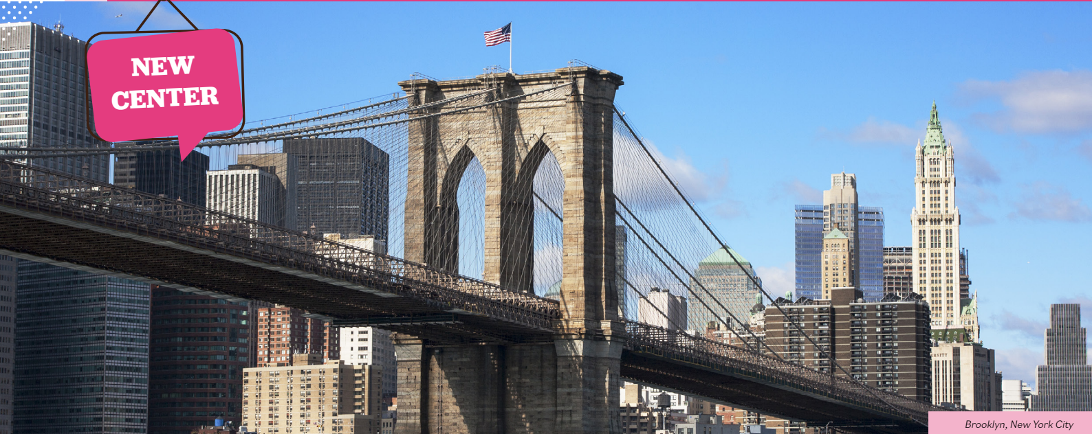
Brooklyn, New York City