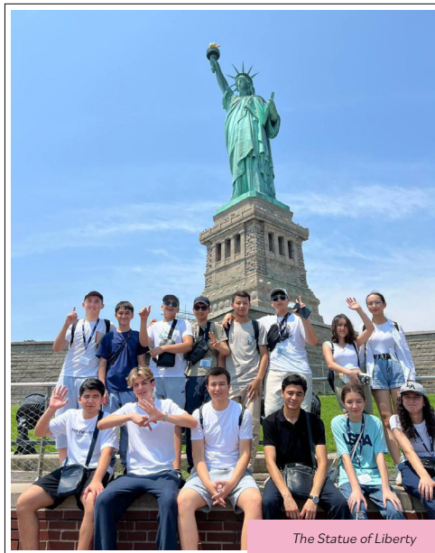
The Statue of Liberty

Residences: Single gender, 4-twin-bedroom apartments with semi-private bathroom, shared living room and kitchen.